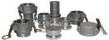
Special Camlock Couplings

Type: A Type: E Type: B Type: F Type: C Type: DC Type: D Type: DP All Types