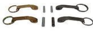
Handle Ring & Pin Assembly

CAMLOCK COUPLER X CAMLOCK ADAPTER CAMLOCK COUPLER X CAMLOCK COUPLER CAMLOCK SPOOL ADAPTER KC Nipples